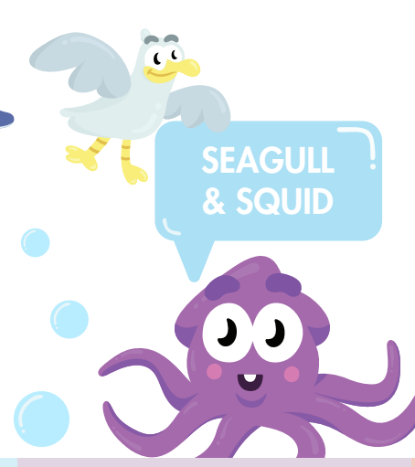
SEAGULL & SQUID