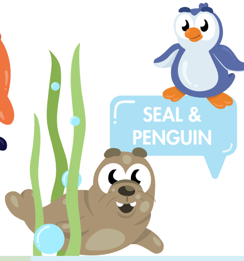
SEAL & PENGUIN