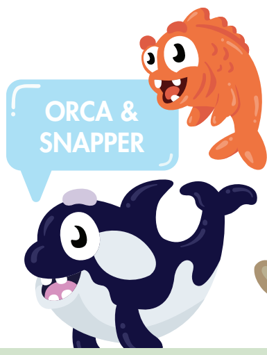
ORCA & SNAPPER