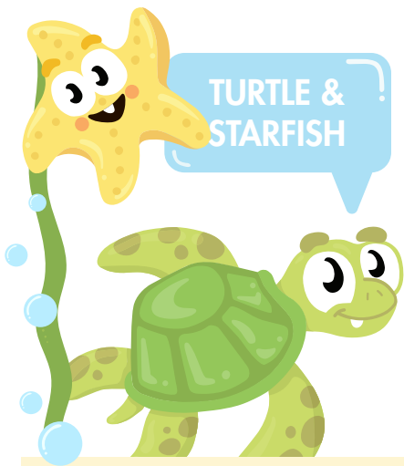
TURTLE & STARFISH